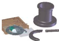
United F-06 "Fireflo" Hydrant Extension Kits