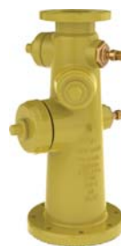
3-Way Valve Opening, 2 Hose Nozzles & 1 Pumper Nozzle with 3" or 4" Monitor Flange