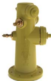
3-Way Valve Opening, 2 Hose Nozzles & 1 Pumper Nozzle